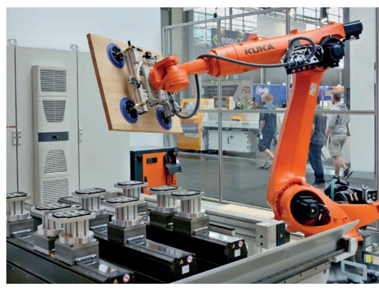
Loading and unloading the machine with the Kuka robot.