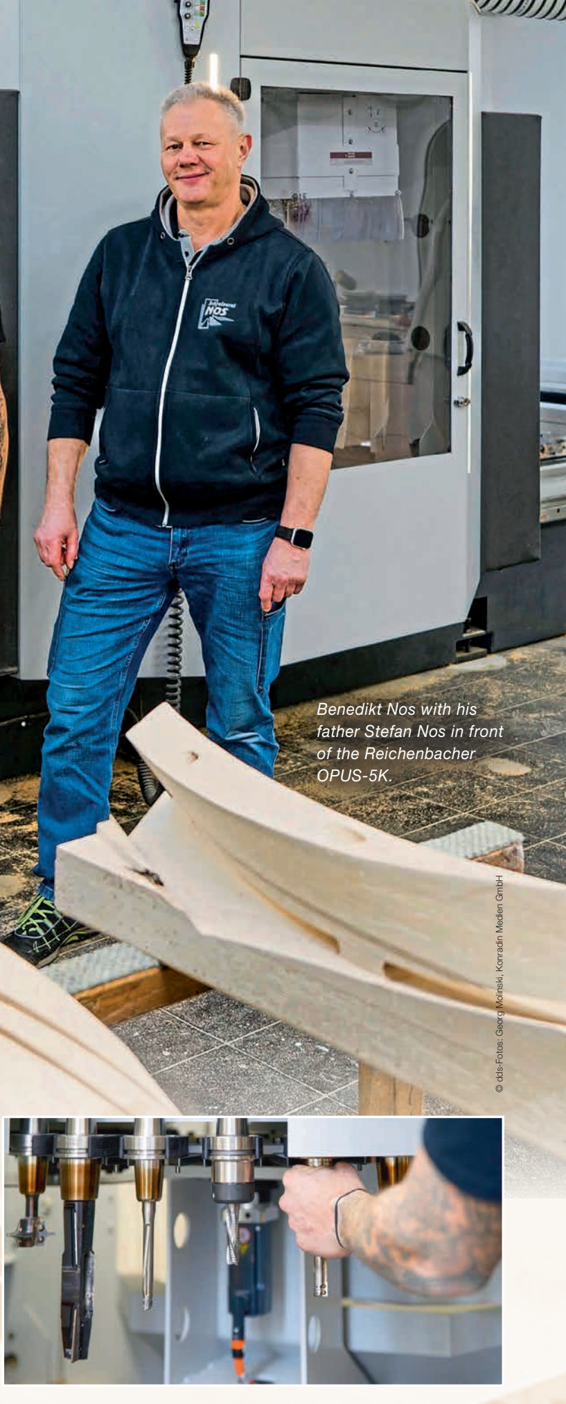
The tool magazine with its 15 places is sufficient for the majority of the machining operations.