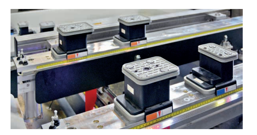
There are LED-positioning strips on the machine bed and on the individual beams to indicate the position of the beams and of the suction cups.

Customers need reliability and trust in the technology. Software and machine form an entity solely because the company direkt cnc-systeme immediately tests new content on the CNC machining centres. The benefit is obvious, as users get a consistently functioning system. Two years ago, Reichenbacher provided the OPUS CNC system for these tests and functional checks. No matter, whether toys or guitars are concerned, doors or stairs produced, or furniture for yacht, caravan and aircraft interiors manufactured – this system with its particularly high Z-stroke of 450 mm permits even the machining of unusual component sizes.