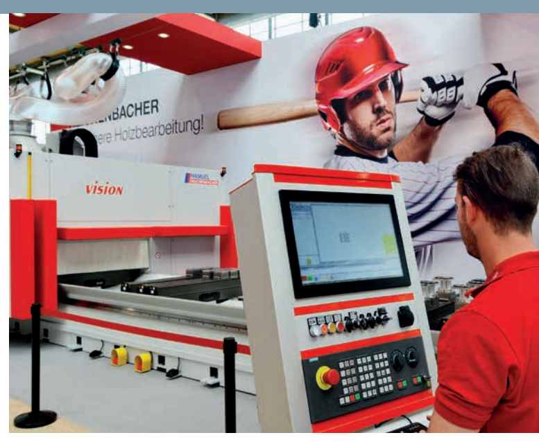
VISION-III-ST with automatic table and operator.