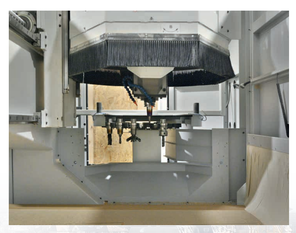
5-axis working unit with automatic 15-fold plate changer of the OPUS-5R.

The managing director concludes, "We are fast and precise. Whereas it used to take us 36 hours with a sliding table saw to produce 400 templates for cap formwork, today we position one panel and the CNC produces the same number in 15 hours at the push of a button. The demand for bridges in Germany is enormous, because many are decades old and need to be renovated or newly built. Today we are involved in projects we would not have been able to realise even one year ago. And that applies to bridges just as much as to roof trusses."