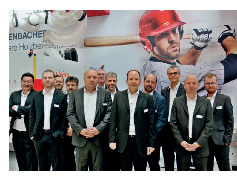
Our team worked together smoothly.