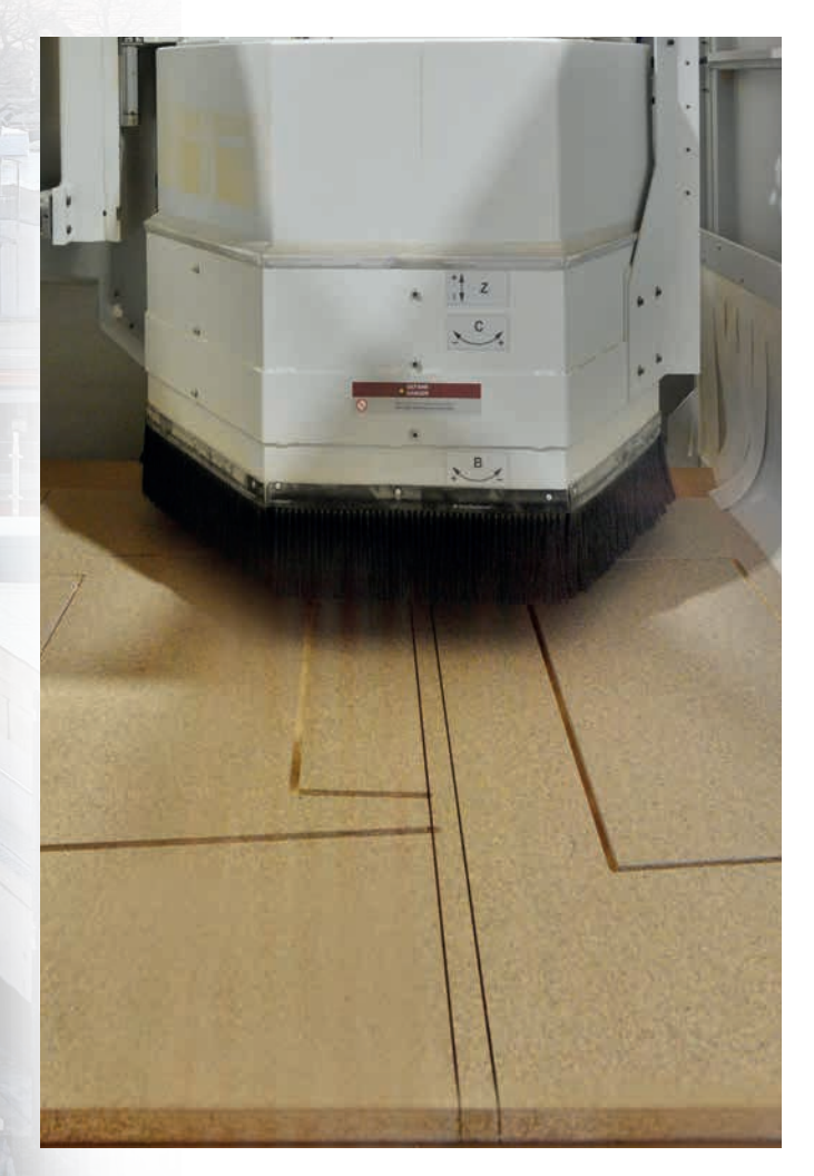
Cutting of cap formwork: precise and quick milling of the templates from the panels.